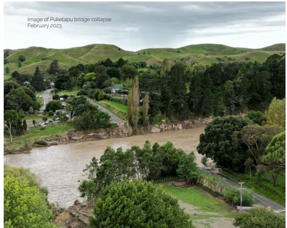
Image of Puketapu bridge collapse February 2023.

"It was quite an overwhelming experience which ultimately brought the community spirit out in everyone."